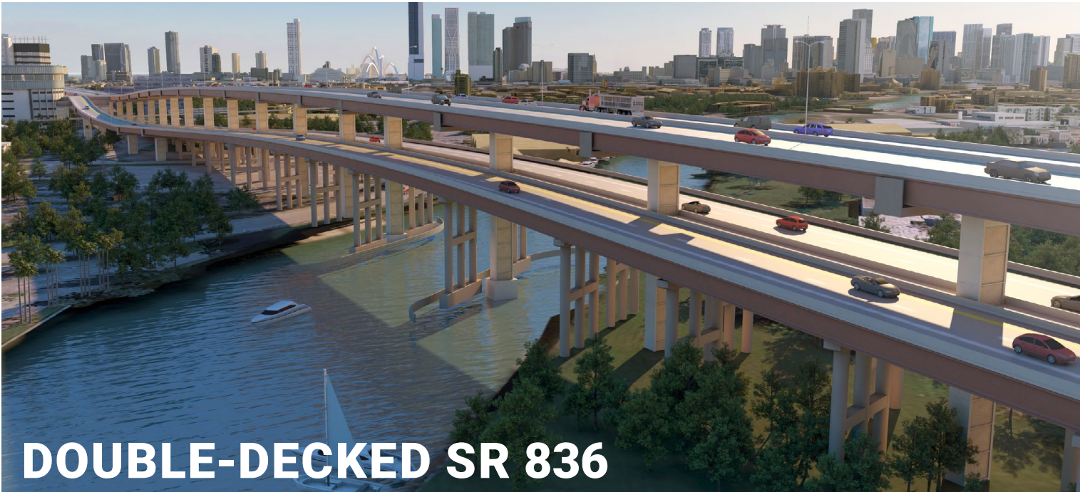
DOUBLE-DECKED SR 836