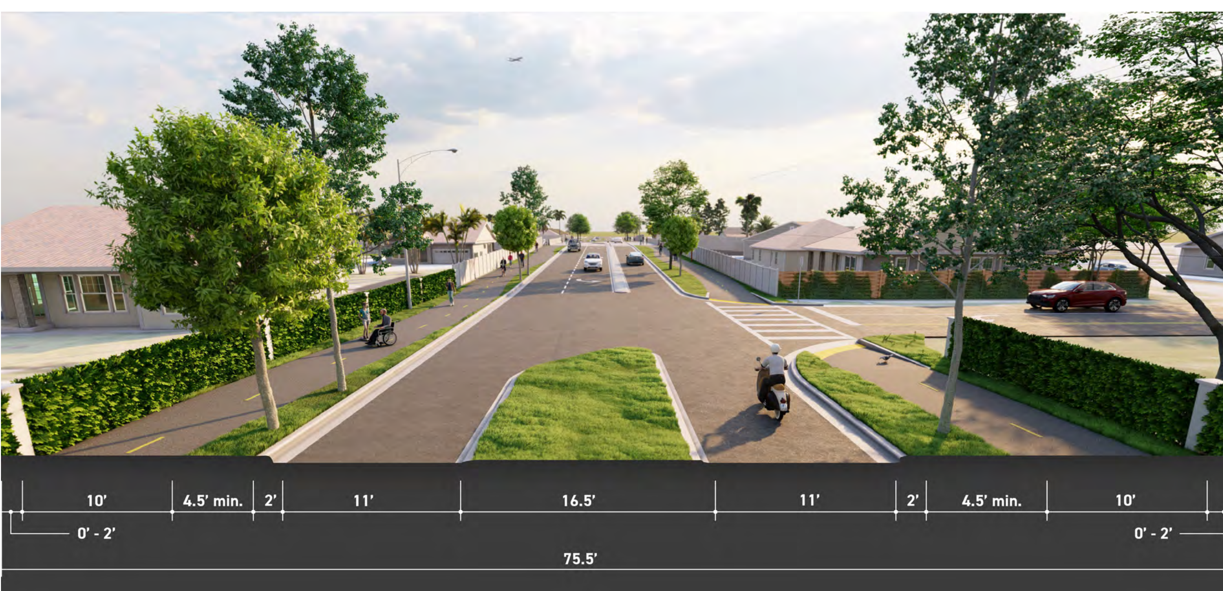
ROADWAY TYPICAL SECTION